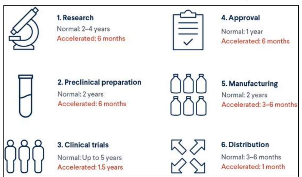
Figure 1. Overview: Normal vs. Accelerated Vaccine Development Process